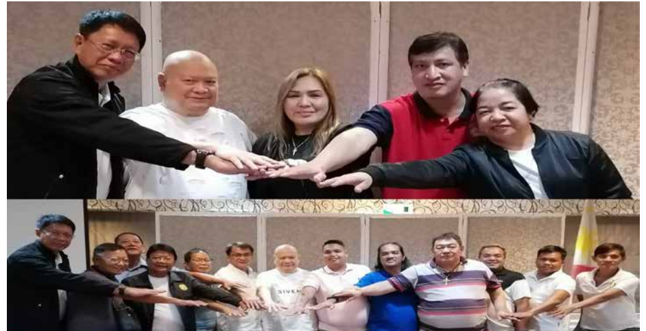
MMTCI GROUP PHOTO