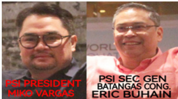
Philippine Swimming Inc. Official