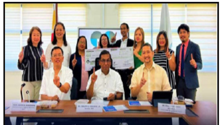
Project ACCELERATES, paving the way for a smarter education---p.2

ACCEPTING ADS, PLEASE CALL: 0977-7844136/ 0968-7122927