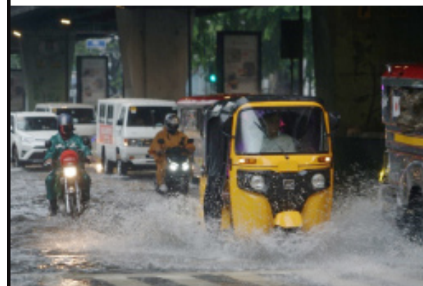
SAGLIT na pag-uulan ay baha na kaagad ang dulot kagaya sa ilang bahagi ng Maynila na naranasan kamakailan.