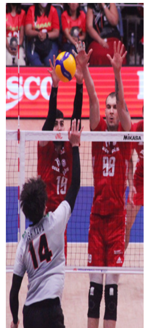
VNL POLAND VS JAPAN ILAN sa naging bahagi ng maaksyong tagpo sa pagitan ng Poland at Japan sa huling laban nila sa ginanap na Volleyball Nations League (VNL) men's tournament na ginanap sa Mall of Asia Arena, Pasay City.

Tinamo ng nationals ang Macau, 25-21, 25-15, 25-14, at Mongolia, 22-25, 25-21, 26-24, 23-25, 15-12, para umabot sa final 12 ng ang AVC Challenge Cup for Men sa University of Taipei Hall. Nagbigay ng takot ang mga Pinoy sa powerhouse Bahrain bago nagbunga, 25-20, 25-17, 25-23, sa pagpapatuloy ng laro. Kasama rin sa Taiwan ang host country, Australia, South Korea, Hong Kong, Kazakhstan, India, Vietnam, Saudi Arabia at Thailand.