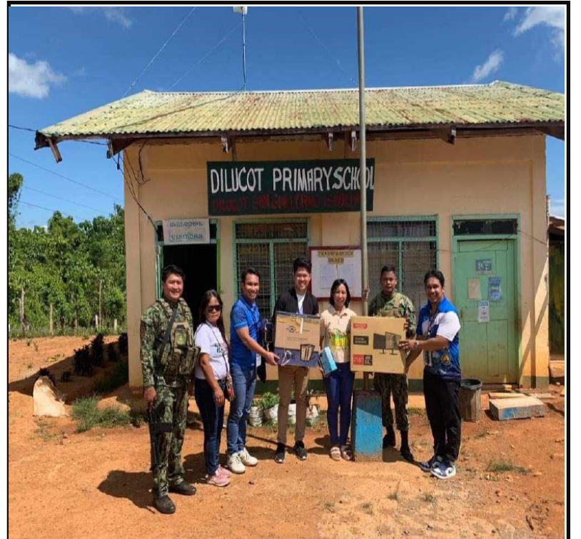
S&T Initiatives in aid to Indigenous Communities---p.6A