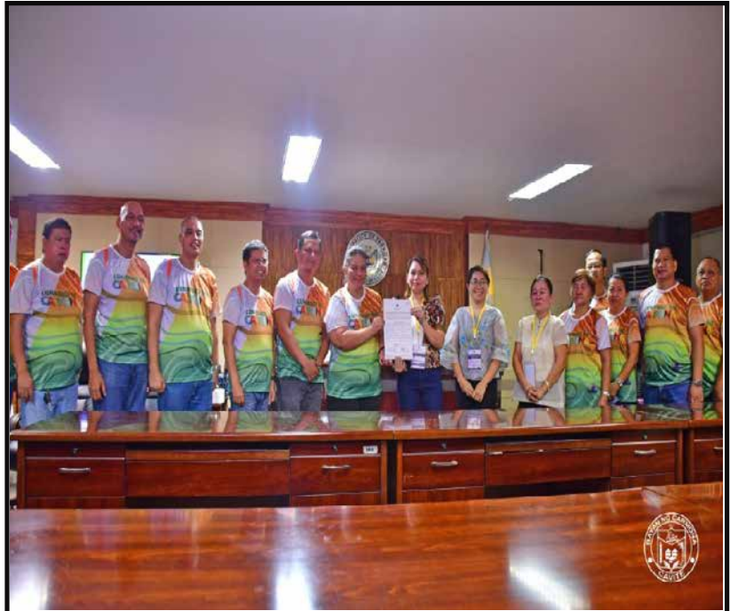
Residents say "yes" to Carmona's cityhood---p.6D