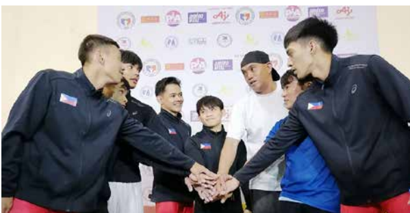
PHILIPPINE MEN GYMNASTICS TEAM

Awarding Ceremony para sa Team at Group All-Around; Hunyo 2 - Apparatus Finals Individwal (Hoop, Ball) at Group (5 Hoops); Hunyo 3 - Apparatus Finals Individwal (Clubs, Ribbon) at Group (3 Ribbons + 2 Balls). Awarding Ceremony para sa lahat ng Apparatus Finals. Inaasahang darating ang mga koponan sa Mayo 28-29 habang ang pagpupulong ng mga hurado at ang draw ay sa Mayo 30.