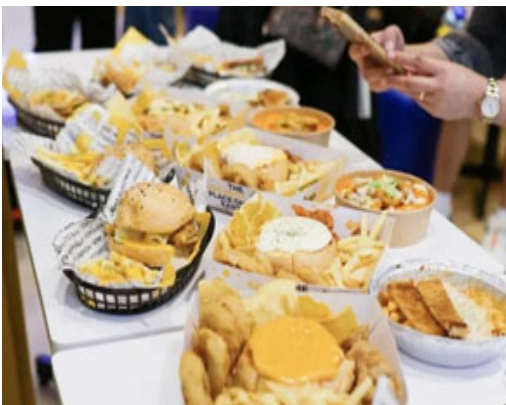
Some of the Cheesy products of EBC were showcased during the event

For more information, you may visit EBC's social media pages: Facebook, Instagram, Tiktok, and YouTube @everythingbutcheese. You can also send your email to marketing@everythingbutcheese.com.