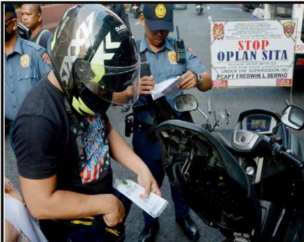
TULOY ang Manila Police District Barbosa Station 14 sa pagpapatupad ng kanilang 'oplan sita' laban sa mga motorcycle rider na sa kabila na walang lisensiya at dokumento o maging falso ang rehistro ay nagmamaneho pa rin ng motorsiklo. Direkto sa impounding area sa Central Market ang mga napapatunayang may paglabag.

Nabatid na inaasahang sa darating na Agosto matatapos ang pagsasaayos ng NGCP para sa dekalidad na transmission lines.