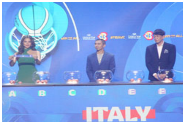
FIBA Basketball World Cup 2023 Draw

Ang World Cup tip sa Agosto 25 at magtatapos sa Setyembre 10. Ang Groups A, B, C at D ay maglalaro sa Pilipinas (Philippine Arena, Smart Araneta Coliseum, Mall of Asia Arena); Group E at F sa Okinawa, Japan; at Group G at H sa Jakarta, Indonesia. Hindi nag-qualify ang Indonesia matapos mawalan ng kahit quarterfinal spot sa 2022 Fiba Asia Cup sa Jakarta.