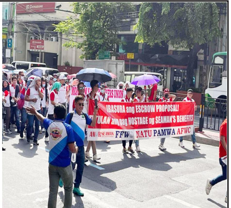
LABOR GROUP HOLD MASSIVE RALLY, EXPRESS GRATITUDE FOR POLICE AID---p. 2

ACCEPTING ADS, PLEASE CALL: 0977-7844136/ 0968-7122927